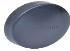
HDPE End Cap 20mm to 315mm