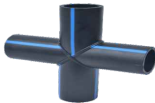
Cross Tee 63mm to 315mm