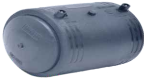
End Cap 20mm to 315mm