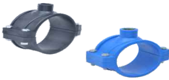
Service Saddle 32mm to 315mm