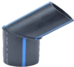
Bend 45° 63mm to 315mm