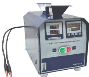
Electrofusion Welding Machine