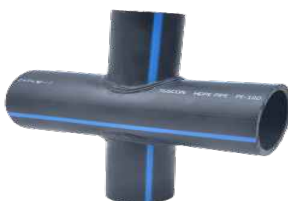
Unequal Cross Tee 63mm to 315mm