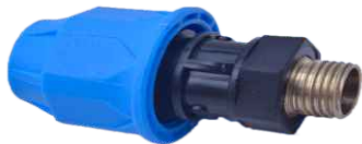
MTA Brass 20mm to 110mm