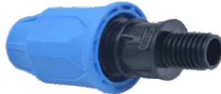
MTA 20mm to 110mm