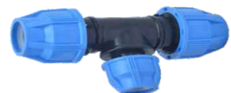
Reducing Tee 20mm to 110mm