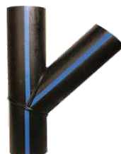
Y Tee 63mm to 315mm