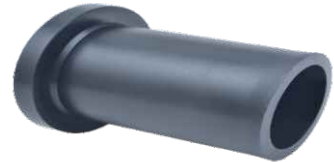
Tailpiece 20mm to 315mm