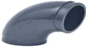
HDPE Elbow 20mm to 315mm