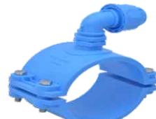
Integrated Saddle 63mm to 200mm