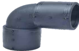
Elbow 90° 225mm to 315mm