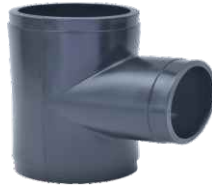
HDPE TEE 20mm to 315mm