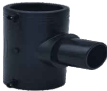
Reducing Tee 63mm to 200mm