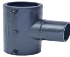
TEE 20mm to 200mm