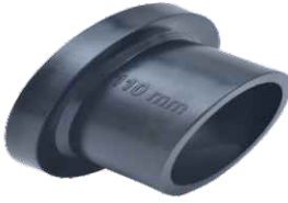
Long Neck 20mm to 400mm