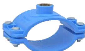
Premium Saddle 63mm to 200mm