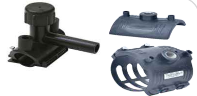
Electrofusion Saddle 63mm to 315mm