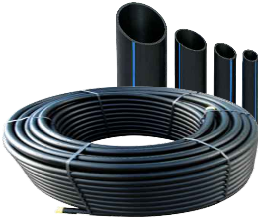
HDPE Pipe 20mm to 200mm