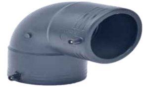
Elbow 20mm to 200mm