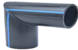
Bend 90° 63mm to 315mm