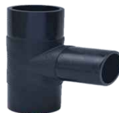
HDPE TEE 20mm to 315mm