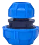
Reducer 20mm to 110mm