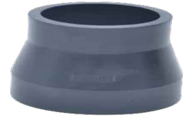
HDPE Reducer 20mm to 400mm