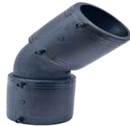
45° Elbow 20mm to 315mm