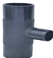
HDPE Reducing TEE 20mm to 315mm