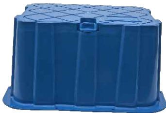
Water Meter Box