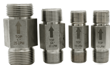
Flow Control Valve