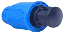
End Cap 20mm to 110mm