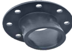
Tailpiece Flange 63mm to 315mm