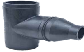
HDPE Reducing TEE 20mm to 315mm