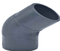
Elbow 45° 63mm to 315mm