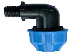
MTA Elbow 20mm to 110mm