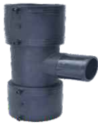
Reducing Tee (Kit) 225mm to 315mm