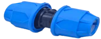
Coupler 20mm to 110mm