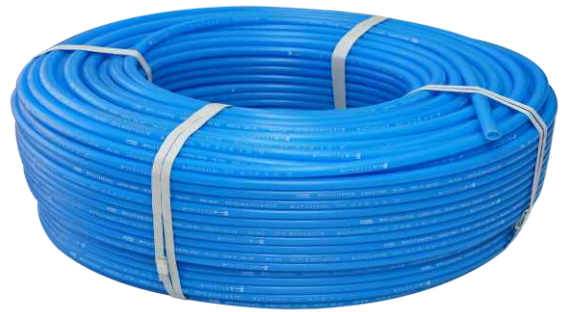
MDPE Pipe 20mm to 200mm