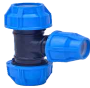
90° TEE 20mm to 110mm