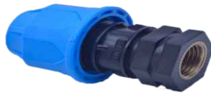
FTA Brass 20mm to 110mm