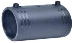
Coupler 20mm to 315mm